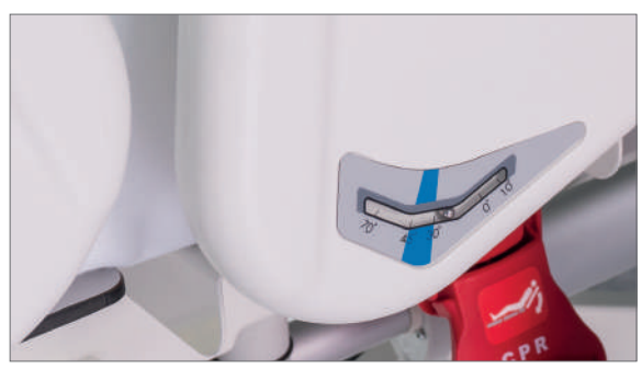
Optimal angle indicator. Indicators help to position the patient in the prevention of ventilator pneumonia (VAP).