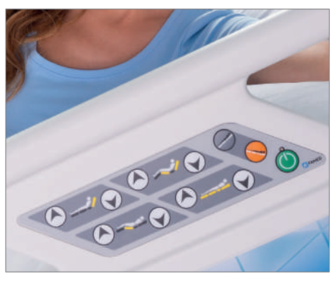
Panel for personnel with quick access to the Trendelenburg tilt.