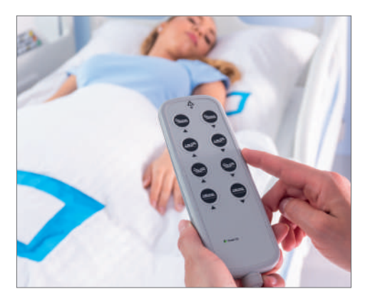
Wired remote control for the patient and staff (variant with 8 buttons in the Comfort and Premium version).