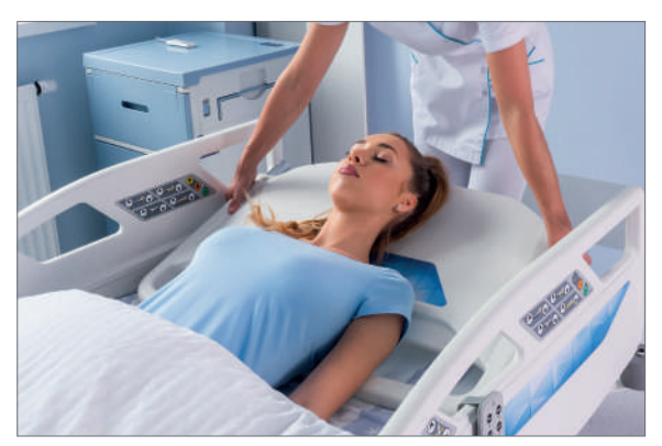
Use the head board as a CPR support. The unique design of the SoftDropPlus™ side rails gives an unprecedented amount of space for a resuscitation action or a mattress. Additionally, the quickly removable, stable head board can be used as additional support under the patient in the case of CPR action.