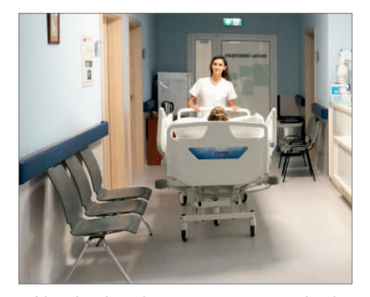
Fifth wheel makes it easier to guide the bed in narrow places.