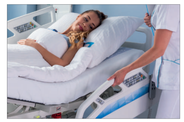
SoftDropPlus™ side rails along the entire length of the bed. Gas springs ensure a quiet and smooth lowering motion. The constant distance between the elements ensures comfortable and safe usage, preventing accidental trapping of hands. The movement can be initiated with one hand, while the other hand can be used to protect the patient.