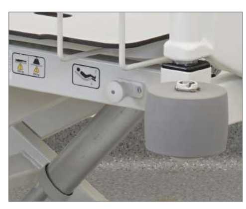
Bed length extension with lock (not available in the Light version) allows for a comfortable stay also for taller patients.