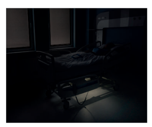
Ambient LED light under the bed.