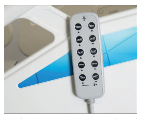
Wired remote control with mechanical lock (key), 10-button. Remote control for version without the central panel.