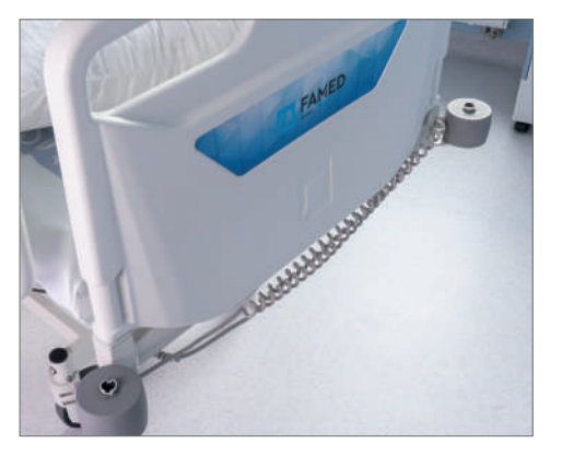
Integrated storage space for the power cord, e.g. when transporting the bed.