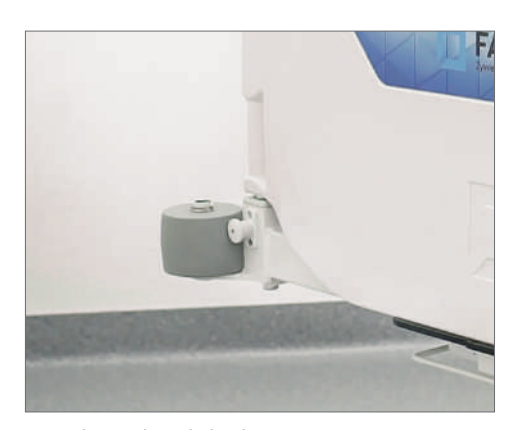
Foot board with lock.