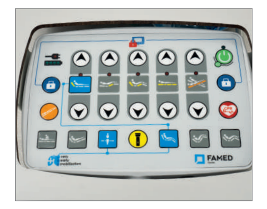
Central panel (supervisor) with VEM functions, one-button positions and electric CPR.