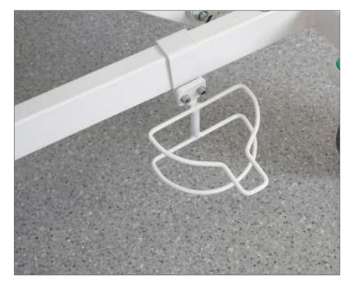
Urine bottle holder