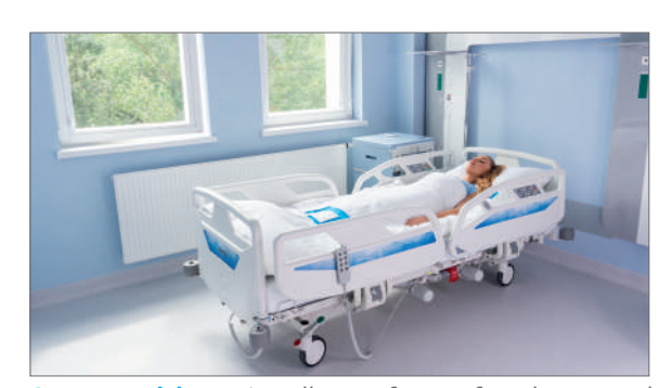
Low position. It allows for safe sleep and comfortable sitting on the bed and getting up. It also allows for easy transfer to a wheelchair.