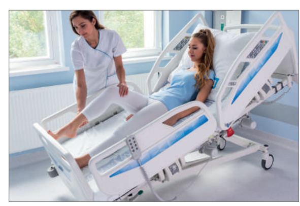
use the best reverse-Trendelenburg angle on the market. Foot board with lock, 18.5° tilt and extended, large diameter reinforcements allow you to safely move the bed and perform exercises and elements of upright standing therapy. Tilts also help to move the patient on the mattress.