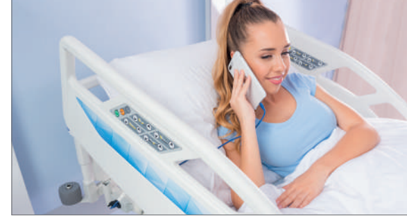
USB sockets. Possibility to charge personal devices. Equipped with a sealed cap. Maximum current up to 2.1A.