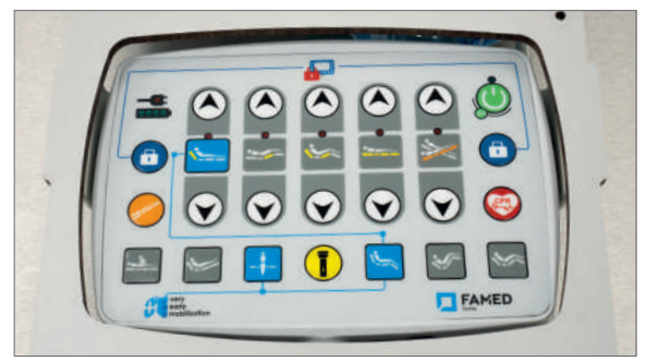
Preprogrammed positions. You can easily set useful and frequently used bed positions with a single button and save time.