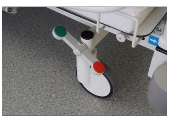
Central wheel lock. The levers on both sides of the bed allow easy and quick blocking of the bed - they can also be operated from the front. Clear color coding and acoustic confirmation of the lever position make it easier to recognize the brake position.