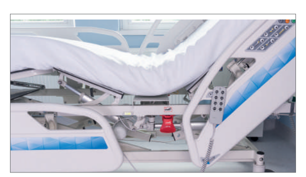
Double autoregression. Reduction of excessive pressure in a sitting position in the area of the lumbar spine and shin.