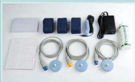
Ultrasound doppler probe 2ea, UC probe 1ea, Event marker 1ea