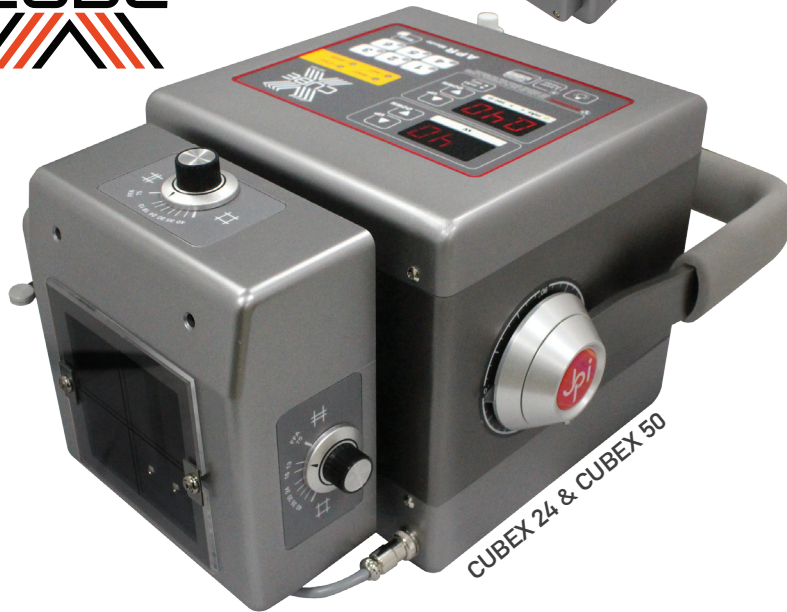
CUBEX 24 & CUBEX 50